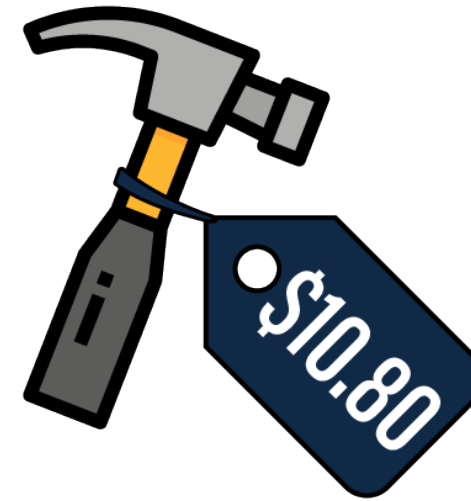
Home Rule Tax Price