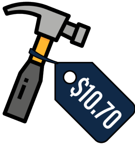
Current Taxed Price